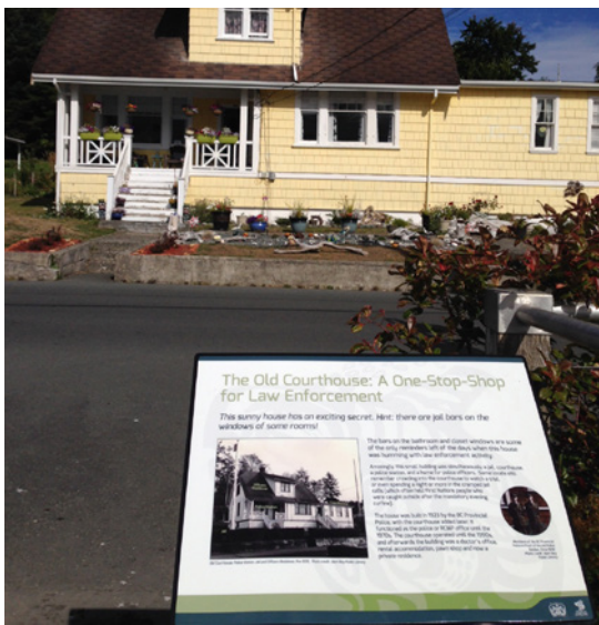
PHOTO: One of the new historical and cultural interpretive signs installed around Alert Bay.