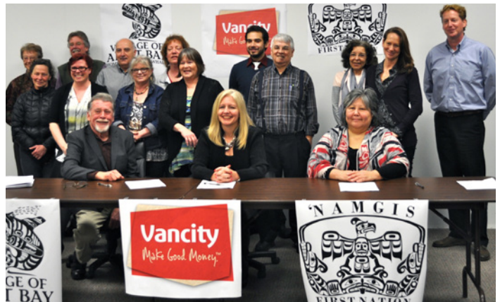
PHOTO: ‘Namgis and the Village of Alert Bay sign an agreement with Vancity Credit Union to provide financial services on Cormorant Island.

The level of detail and community support for Tides of Change also helped persuade Vancity Credit Union (Canada’s second largest credit union) to open its first rural branch in BC with basic branch banking three days a week, and workshops for