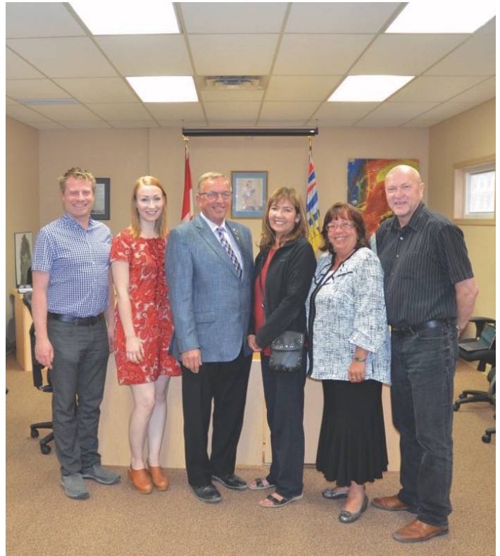
PHOTO: Council members stand with Mayor Al Miller and Chief Barb Cote in celebration of passing Council resolutions, respectively, to participate in the CEDI program until March 2021. (source: Columbia Valley Pioneer).

“I am confident that our common goals for local economic development will foster benefits that extend to many other aspects of community building, and CEDI is giving us the framework to work together to achieve strong local results”