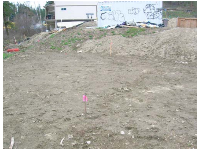
Willowbrook Rest Area one week before planting day