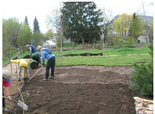
Local resident volunteers laying sod