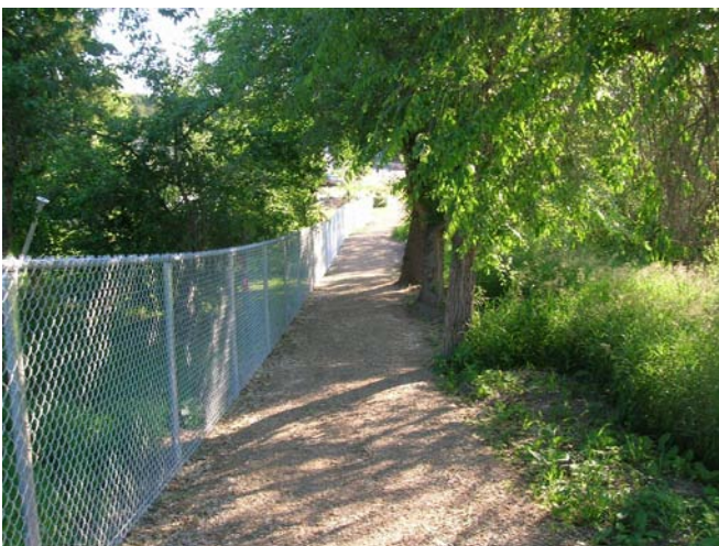
Trail looking east from Schubert Road towards rest area and Highland Park Road and Elementary School