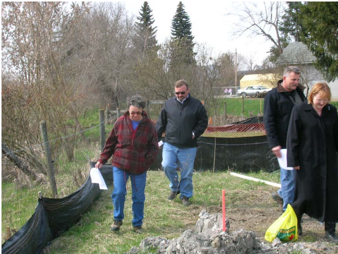
Active Communities, City of Armstrong, and Willowbrook Development reps meeting onsite at beginning of project