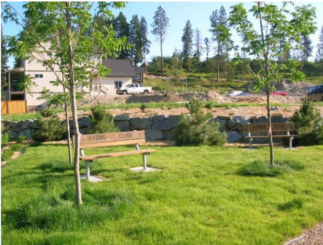
Looking north from rest area