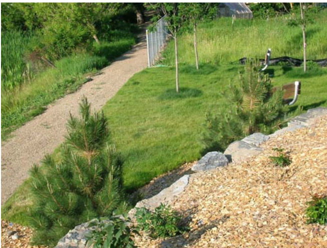
Looking west from rest area