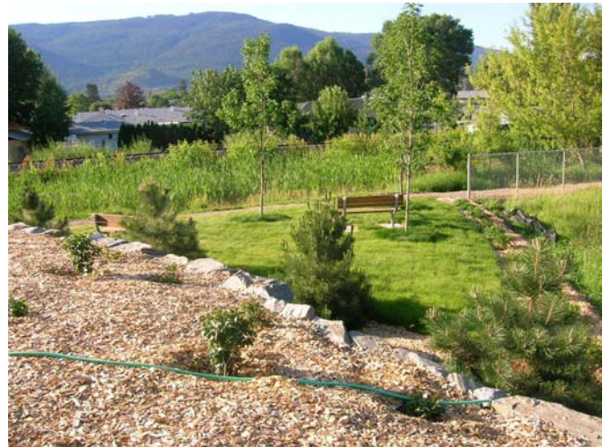
Looking south from rest area