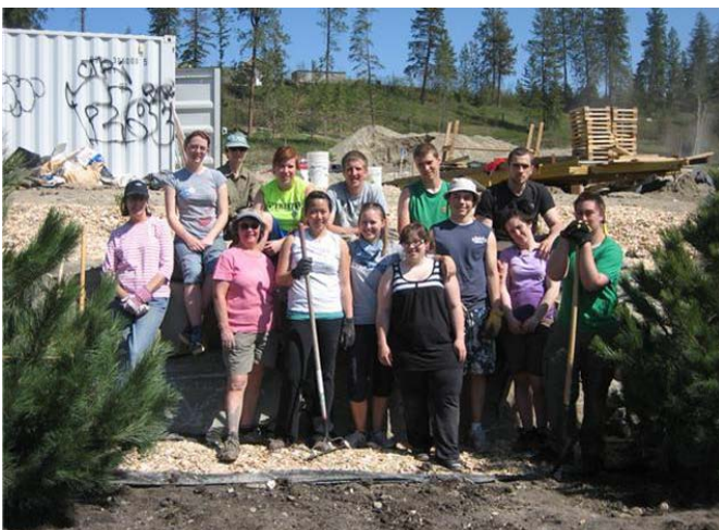
Katimavik and Active Communities volunteers