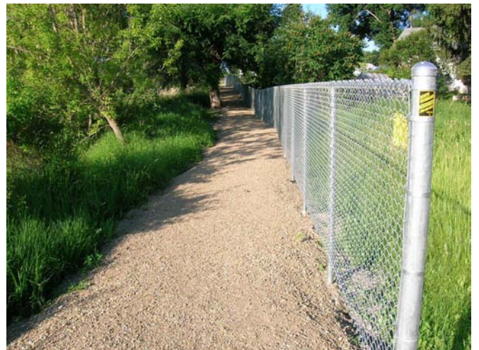
Trail west from rest area to Schubert Road