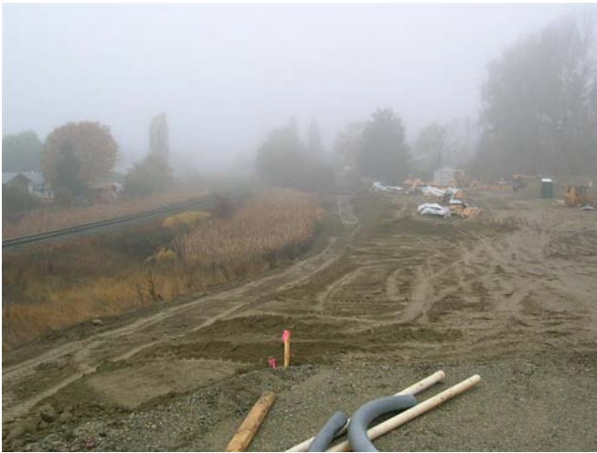
Willowbrook Trail site looking towards Schubert Road